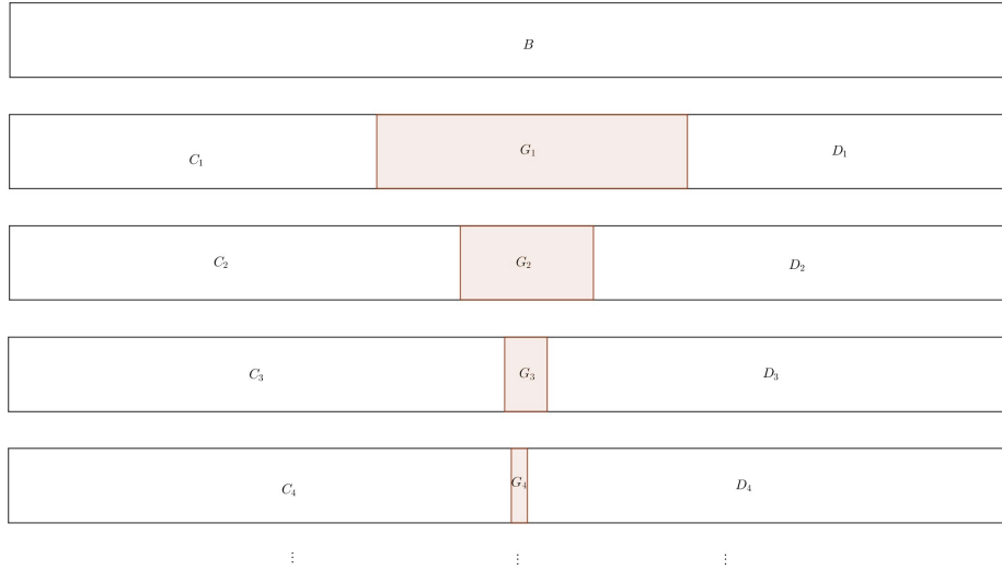
FIGURE 3.1. Savage's error reducing partitions

Remark 3.13. The rest of Savage's proof is not relevant to our work. For the sake of completeness, here is a short account of it. B_1, B_2 form a partition of B , and \bigcap_n G_n \equiv \emptyset . Assuming P6' , one can show that B_1 \equiv B_2 ; but Savage does not use P6' (a postulate that is introduced after Theorem 3), hence he only deduces that B_1 and B_2 are what he calls "almost equivalent" – one of the concepts he used at the time, which we need not go into. By iterating this division he proves that, for every n , every non-null event can be partitioned into 2^n almost equivalent events. At an earlier stage (Part 4) he states that every partition of S into almost equivalent events is almost uniform. Hence, there are almost uniform n -partitions of S for arbitrary large ns . This together with the first claim of his Theorem 2 (Theorem 3.10 in our numbering) proves the existence of the required numeric probability.